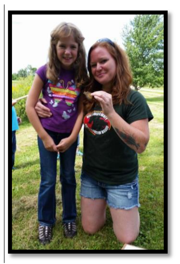
Environmental Education Programming