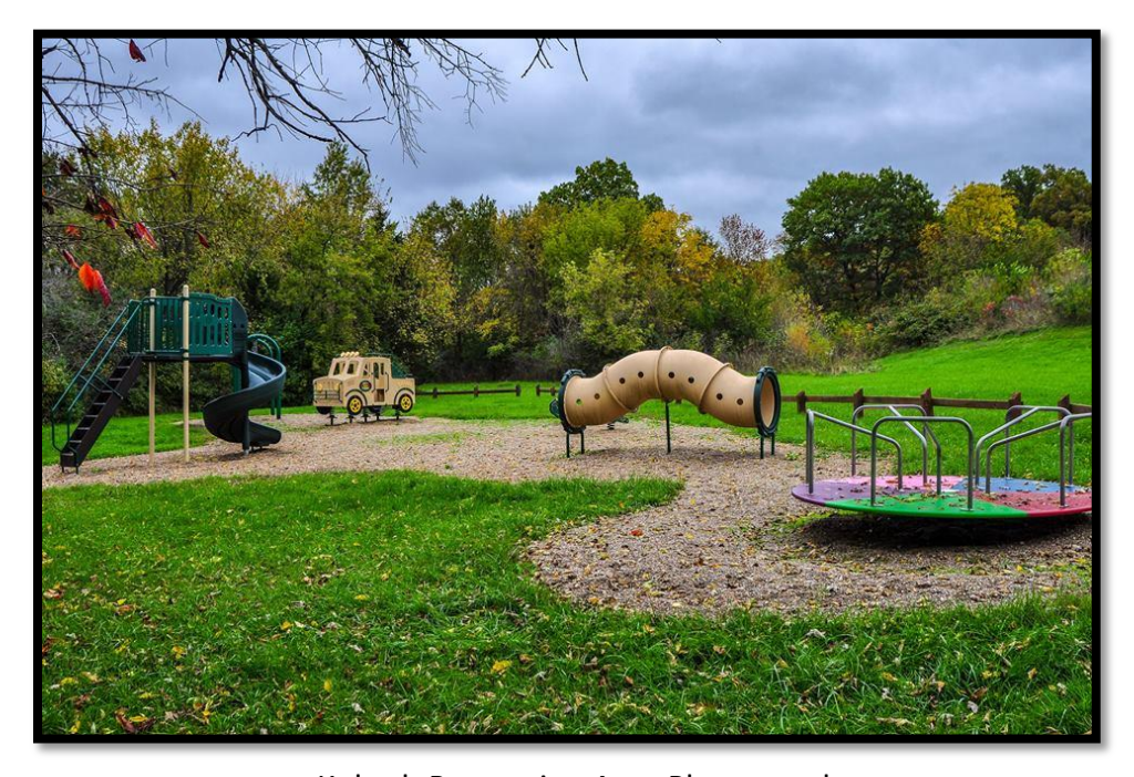
Kokesh Recreation Area Playground