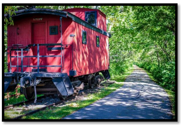
Caboose Restoration and Trail Renovation